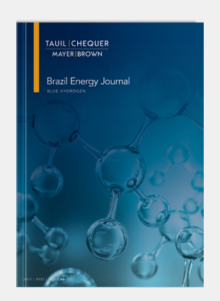
Also Read: Brazil Energy Journal: Blue Hydrogen