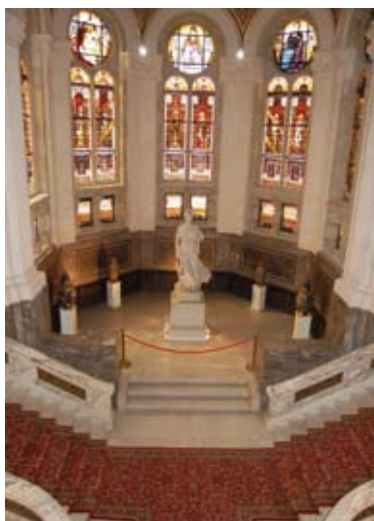
For more information, visit www.pca-cpa.org .